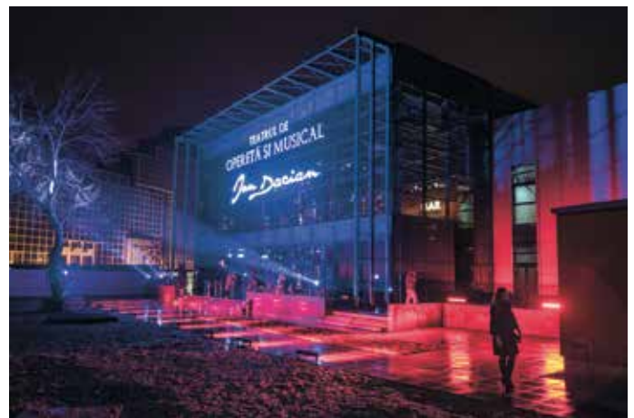
Bucharest National Opera Operetta Hall