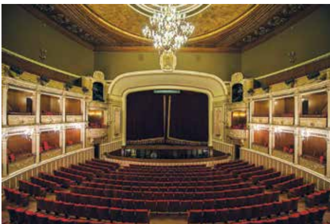
Bucharest National Opera Opera Hall

Opera Europa has never held one of its major conferences in south-east Europe, so a visit is certainly overdue to a broad, varied and beautiful region which encompasses members in Slovenia, Croatia, Serbia, Romania, Bulgaria and Greece.