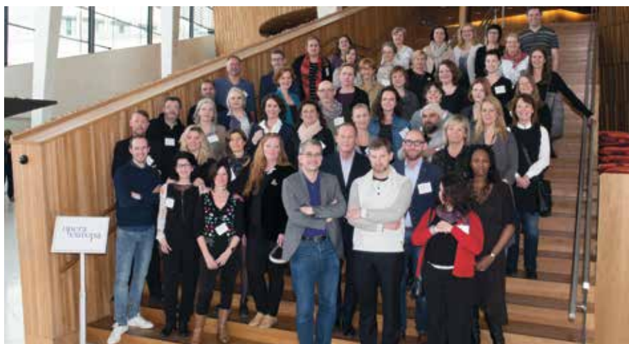
The Costume, Make-up & Wig Forum in Oslo

Participants staying on until Sunday have the opportunity to see Verdi's Les vêpres siciliennes in Stefan Herheim's production.