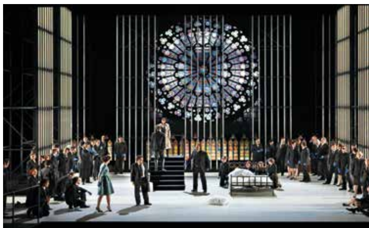
The finale of Act 3 of La Juive in the production premiered at Opera Gent on 14 April 2015