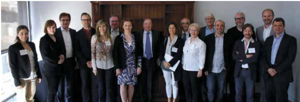
The Opera Europa Board members in Madrid

The Opera Europa Board is the governing body of the association and seeks to represent its members in all their diversity as best possible. It is composed of 15 members, elected for a maximum of two three-year-terms.