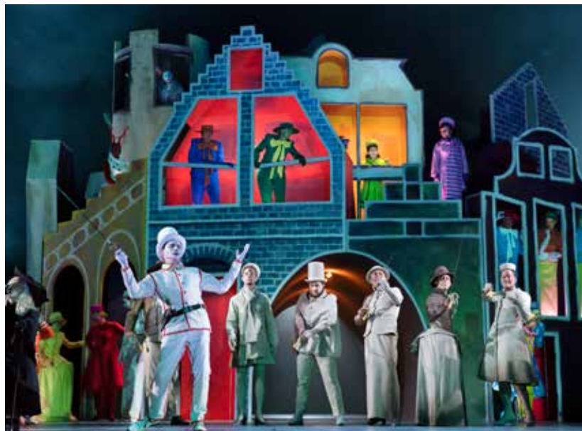
Der Schmied von Gent Schreker | Opera Ballet Vlaanderen

2020 has undoubtedly been a challenging year, and it is greatly encouraging to see opera companies celebrating milestones and gaining recognition for their work.