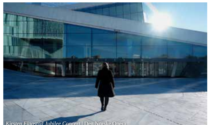
Kirsten Flagstad Jubilee Concert | Den Norske Opera