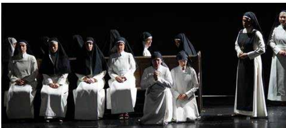
Suor Angelica

1-2 April – European Opera-directing Prize semi-final